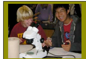
Students taking data on their potato cultures

Additional information for this outreach activity and others has recently been posted on our outreach page on SGN at http://www.sgn.cornell.edu/outreach/ .