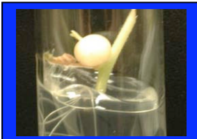
Micropotato on stem nodal segment cultured in a test tube